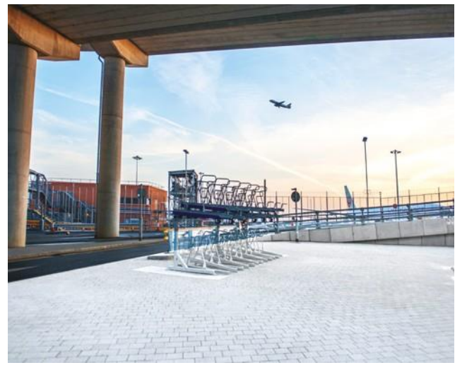
Heathrow Terminal 2, London