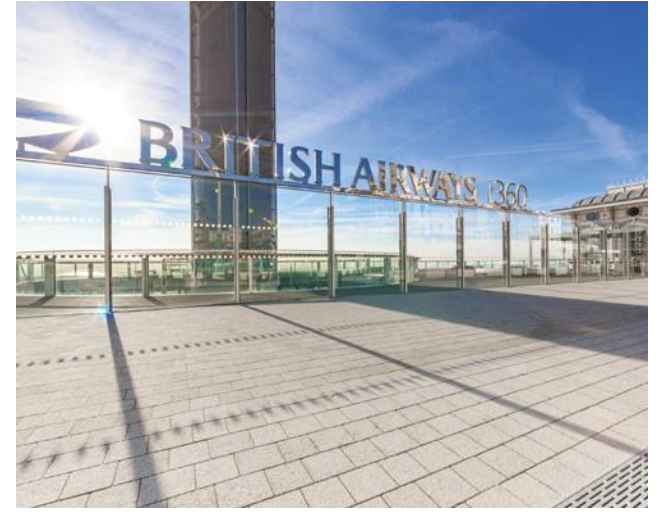
British Airways i360, Brighton

See more online at: <u>www.tobermore.co.uk/projects</u>