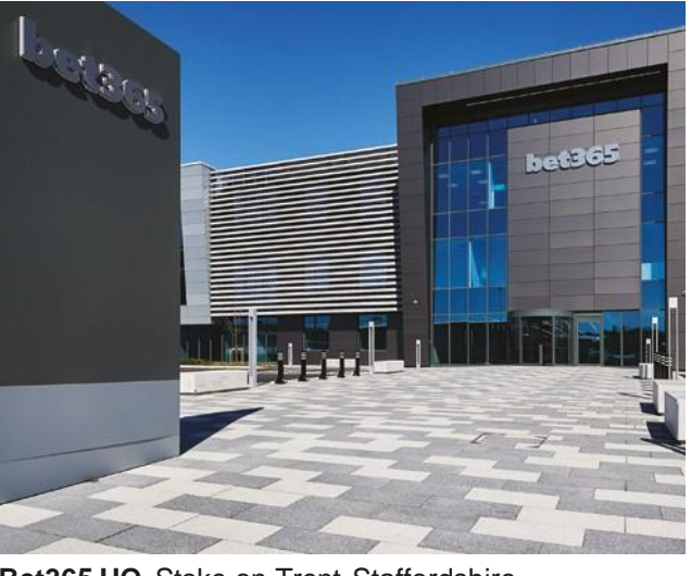
Bet365 HQ, Stoke-on-Trent, Staffordshire