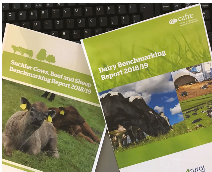
| CAFRE Benchmarking Service Annual Reports

When you receive your farm report, your CAFRE Adviser will be in touch to discuss the report with you and to help you take account of the results when preparing your annual farm development plan.